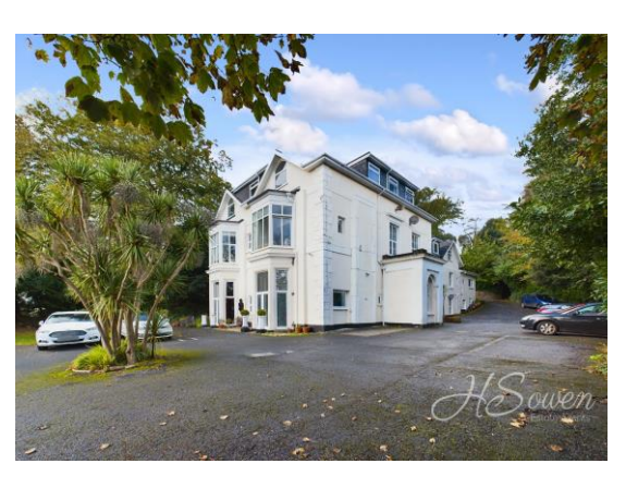
"DoubleClick Insert MAP"